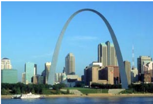
St Louis Arch