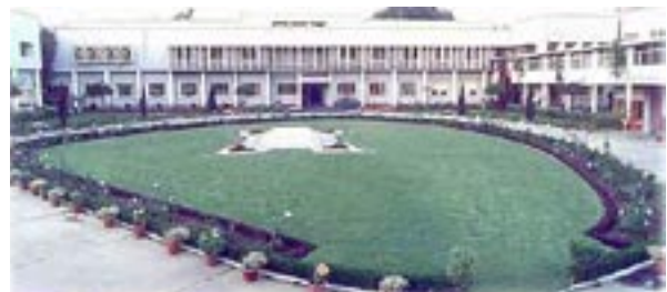
Birbal Sahni Institute of Palaeobotany