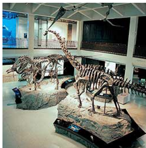
Houston Museum of Natural Science