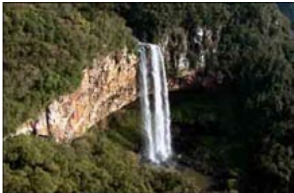
Cascata do Caracol (RS/BR)

The XI Brazilian Meeting on Paleobotany and Palynology (XI RPP) was held at Gramado, Rio Grande do Sul State, from November 7 to 10, 2004. This meeting covered all aspects of the paleobotanical and palynological studies, including future developments in ecology and taxonomy of modern biomes, especially those with Araucaria and Podocarpus . More than 150 participants not only from Brazil, but also from Argentina, Uruguay, Peru, Mexico and other continents attended it. They presented 156 scientific contributions between talks and posters, during the three-day of the meeting. Besides two field trips, one