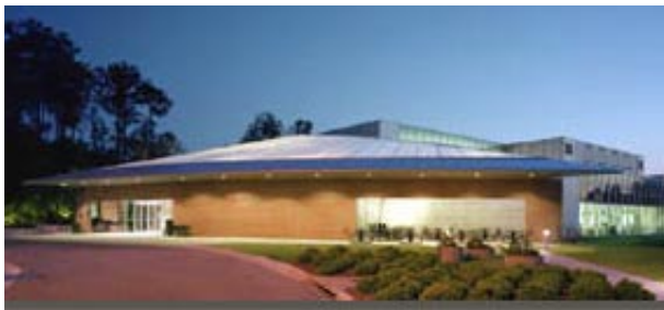
Florida Museum of Natural History