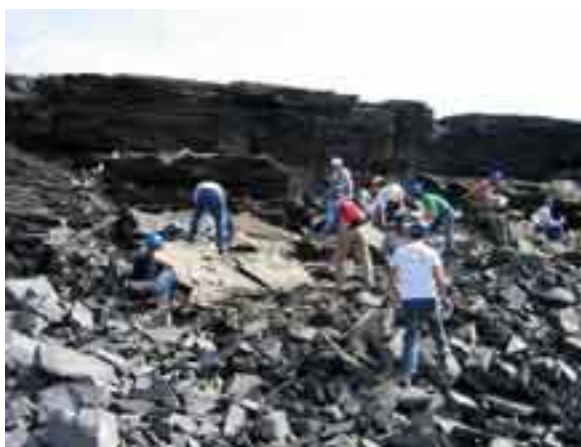
Lower Jurassic quarry