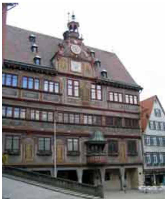
Tübingen Town Hall

The class and lectures were well organized through the week, although timing was a concern in covering some chronostratigraphic intervals....too much information to present, and not enough available time. With the exception of the punctuated fieldtrip (not enough time to search for ammonites!) the class was a great success and well worth every Euro. The quiet city of Tübingen was an excellent host, with the historical part of the city providing an excellent number of opportunities for food, drink, shopping, and general sight-seeing in the beautiful surroundings of the Neckar River valley. After lectures, the local beer gardens down by the river and near the Town Hall were fun and relaxing, and of course, the German beer was most delicious.